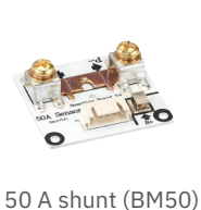
50 A shunt (BM50)